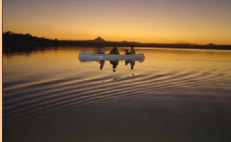
Tranquil waters beckon

Incorporate into your tour a traditional Aussie BBQ or picnic and taste some beautiful bush tucker recipes . Take an eco-tour of the beautiful Wallum Heath lands that surround the lake, discover the small remnant rainforests that still remain in the area. Note: All tours can be booked through reception. Wine and picnic hampers can be arranged and purchased through reception.